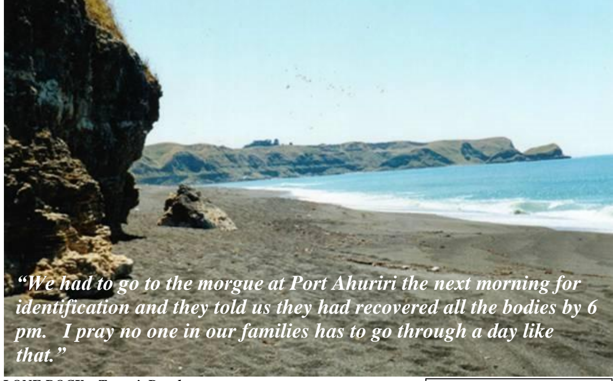
LONE ROCK - TangoioBeach